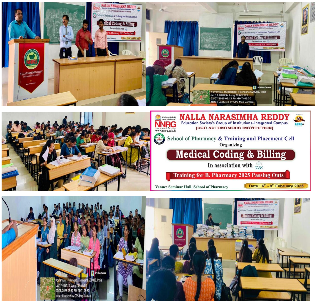
Students attending the Medical Coding & Billing training session for hands-on learning.

continues to create such opportunities to bridge the gap between academic learning and industry requirements.